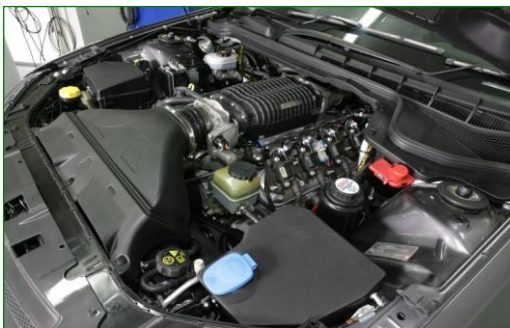
Supercharged VCM OTR installed on E2 GTS with Harrop Supercharger.

Additional parts available through your Streetfighter Specialist Workshop