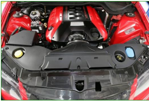
OTR installed on E2 GTS with VCM Infill Panel and Fascia Panel Kit.