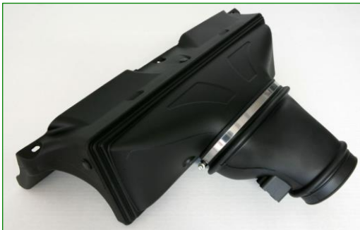
VCM OTR with coupling for fitment on VE Commodore with Magnusson Superchargers